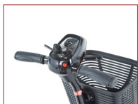
Soft grip & dual controls