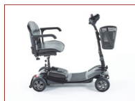
Long floor pan